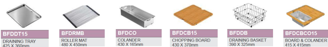
BFDDT15 DRAINING TRAY 425 X 360mm